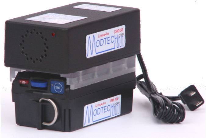
CHG-50 Charger with EM-100 Lithium Ion Battery Pack